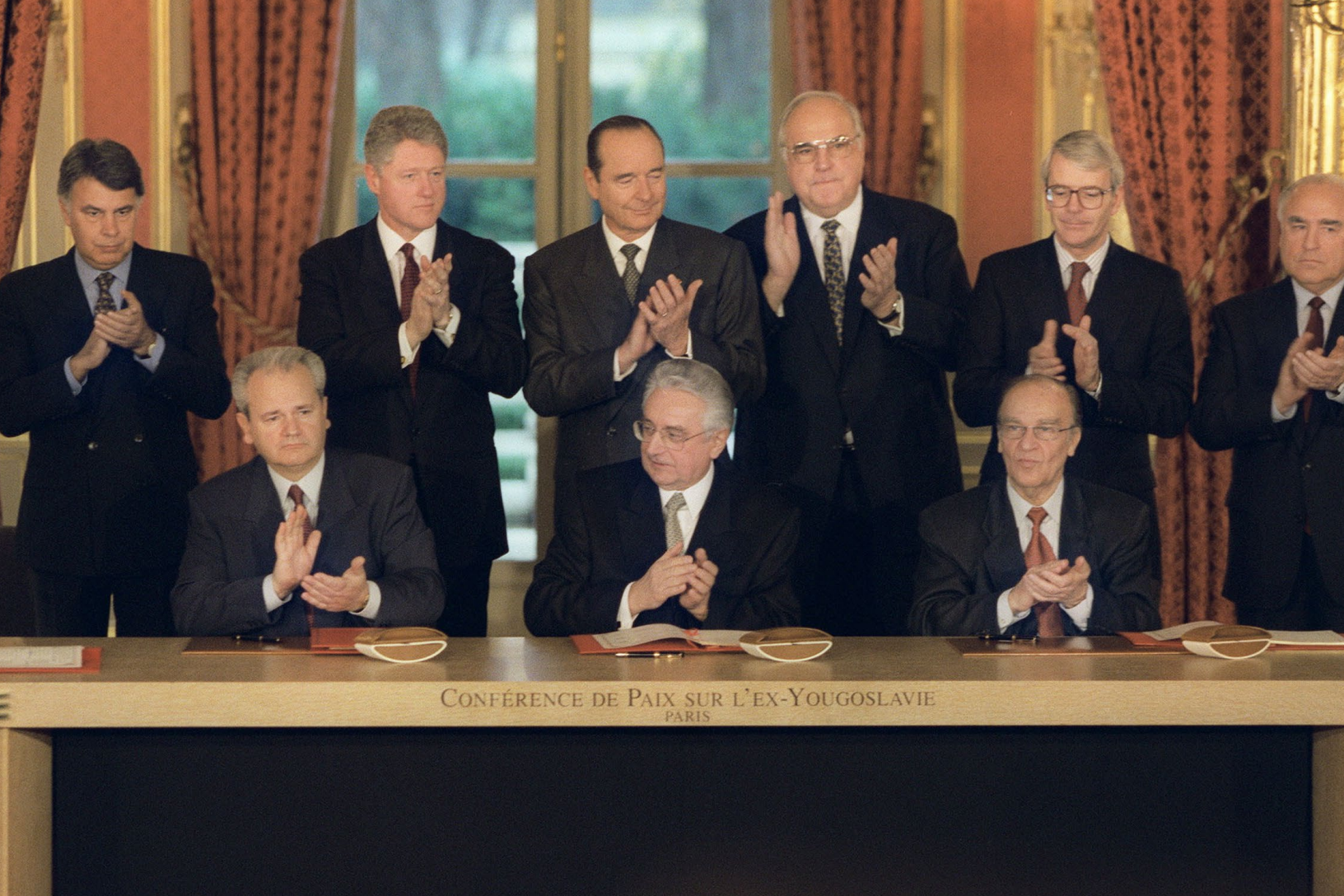
President of Serbia Slobodan Milosevic, President of Croatia Franjo Tudjman, and President of Bosnia and Herzegovina Alija Izetbegovic sign the Dayton Agreement in Paris on December 14, 1995.

domineering outside forces that shaped and organized their lives.