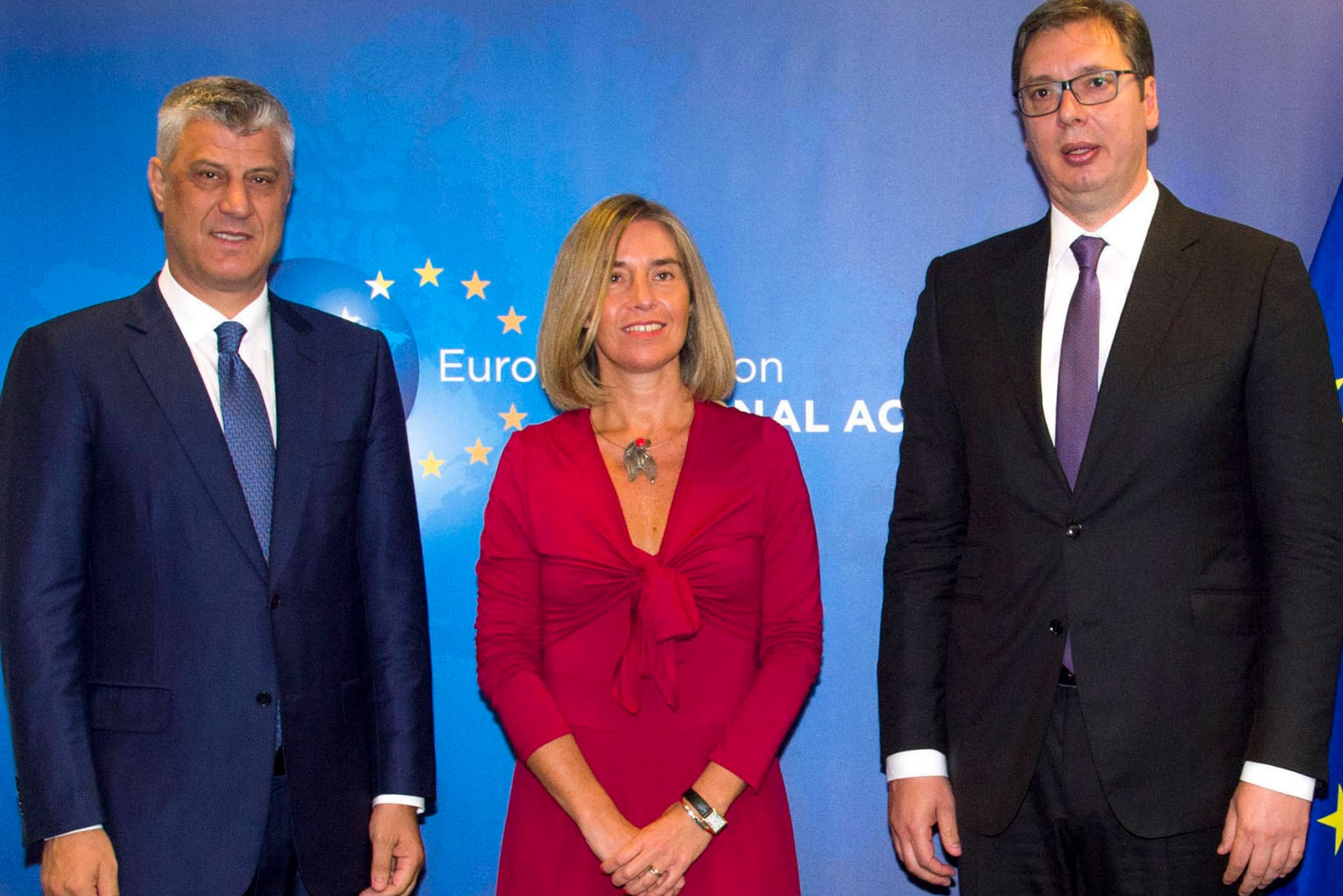
(From left to right) President Hashim Thaçi of Kosovo, EU High Representative Federica Mogherini, and President Aleksandar Vučić of Serbia at the Belgrade-Pristina dialogue round in June 2017.

provocations, openly backed and supported by Russia, has in turn emboldened the leading Bosnian Croat party to seek a revision of Dayton that would further “federalize” BiH along ethnic lines. With the leading Bosniak party also entrenching amid all this, the country’s future is precarious.