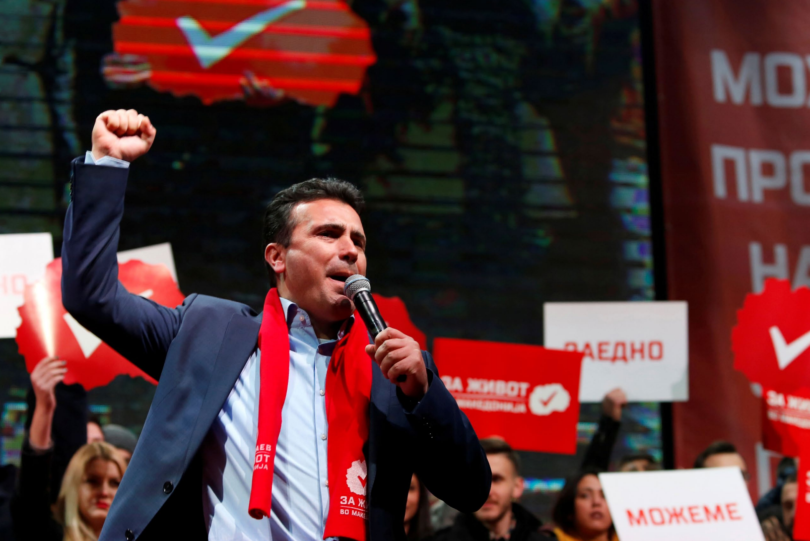
SDSM party leader Zoran Zaev greets supporters during a pre-election rally in Skopje, Macedonia December 4, 2016.

majorities of all confessions reporting either relaxed or no observance of their religious identities. 11 The survey also found all three constituent communities—Bosnian Croats, Bosnian Serbs, and Bosnian Muslims—strongly condemning the Islamic State of Iraq and al-Sham (ISIS) and disapproving of those going abroad to fight.