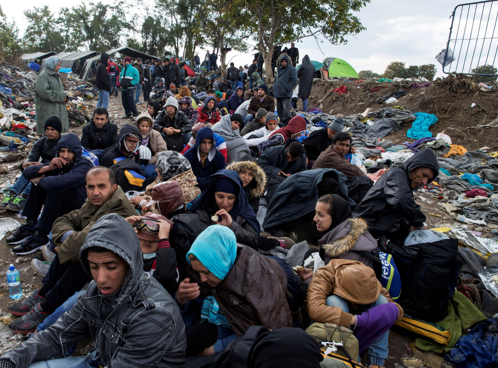
Migrants sit along a road as they wait to cross the border with Croatia near the village of Berkasovo, Serbia October 21, 2015.